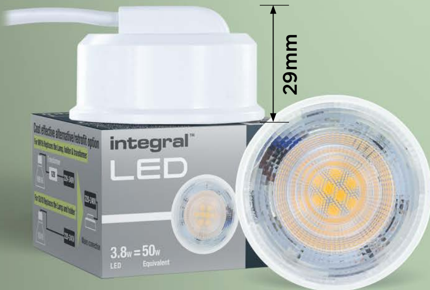
50mm Diameter (same as GU10/MR16 lamps)

All in One solution - Easy to install No need for a lamp holder or transformer