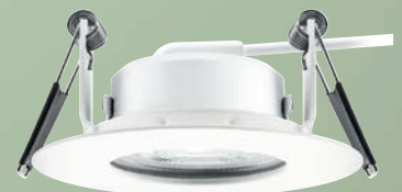
Evolight fitted in a downlight