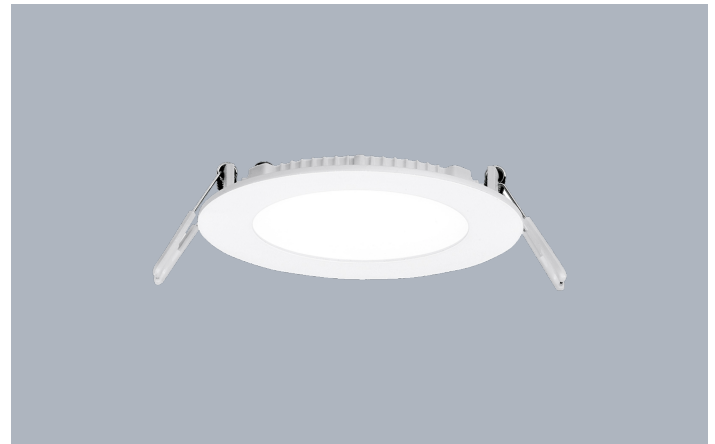
Slim-Fit™ 6W IP44 Round Low Profile LED Downlight