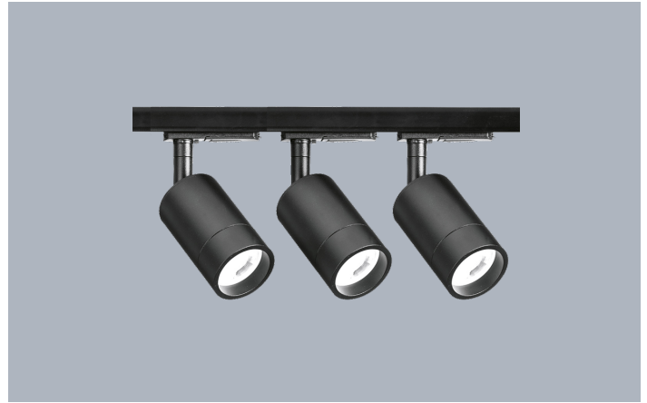
GU10 Adjustable Single Circuit Spotlight Kit