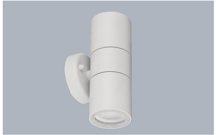
WallE™ GU10 IP44 Up/Down Wall Light